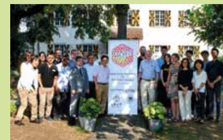
Fourth SOIFIT Meeting at the Paul Scherrer Institute, Switzerland